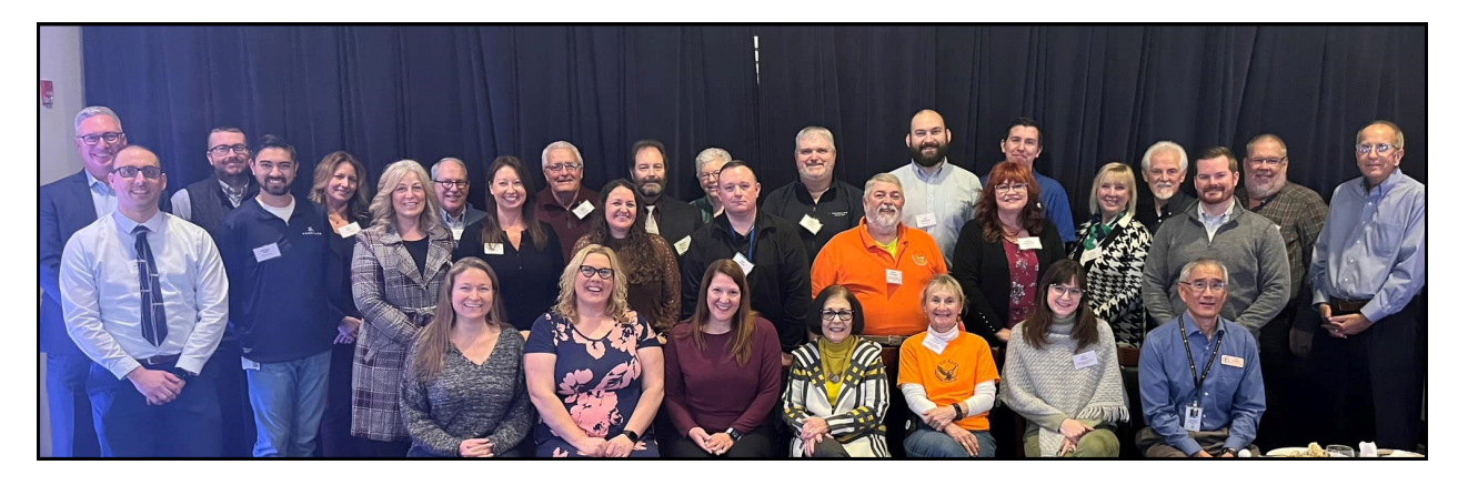
One Body Collaboratives was one of 12 nonprofits to be honored at the Woodward Foundation Grants Luncheon.